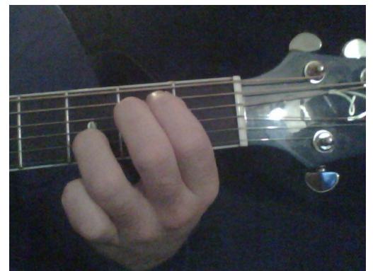
Calluses help guitarists by toughening the fingertips. The chord shown is Em7.

Your fingertips develop calluses the more you practice. Over time, they begin to toughen and that is normal. One way to keep from losing your calluses is to avoid playing directly after soaking the fingers. This means after showering or doing dishes—any activity that has the fingers immersed in water for several minutes. Wait for the skin to dry out again before playing to avoid softening the calluses you've worked hard to build.